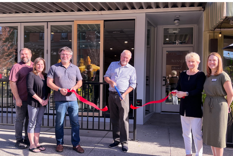
Avennia Ribbon Cutting 10/5

Grand Opening Weekend! SATURDAY, NOVEMBER 11 | 12:00 – 2:00PM