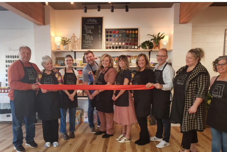
Enable Art Ribbon Cutting 11/3

If your business has something to celebrate reach out to us and find out how to schedule your ribbon cutting!