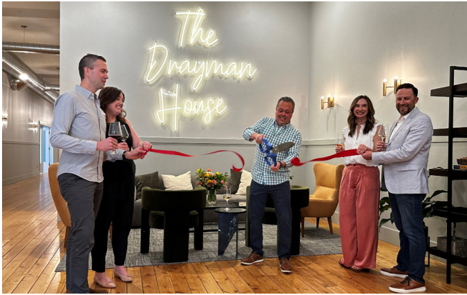
The Drayman House 4.19