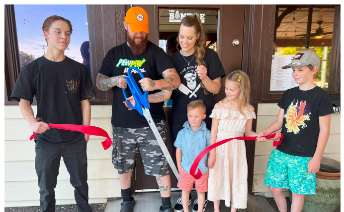
The Bonfire 6.20