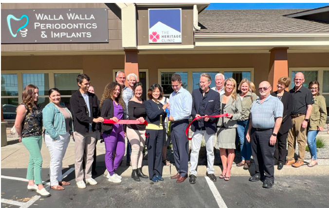
The Heritage Clinic 5.30