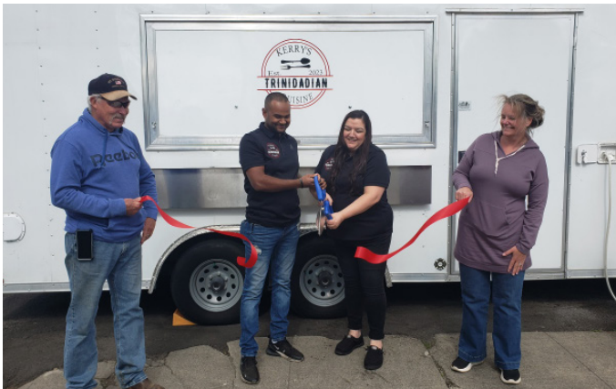
Kerry's Trinidadian Cuisine 5.7