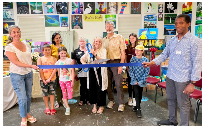
Brushes n' Brix 5.31