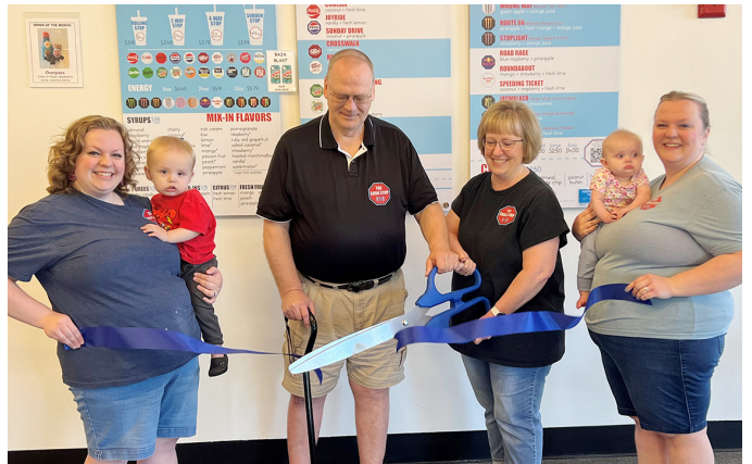
The Soda Stop 5.17