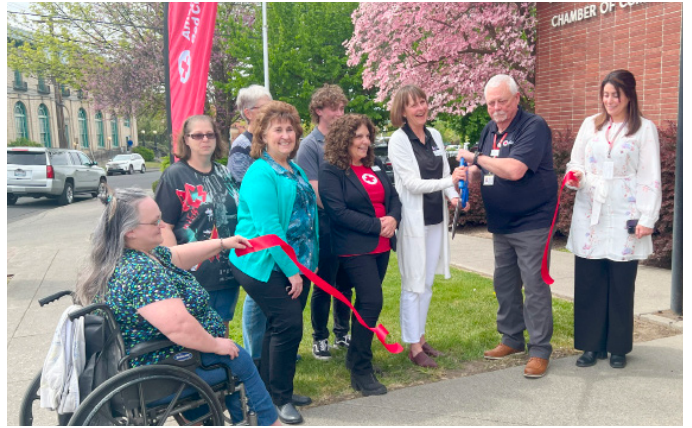
The American Red Cross 4.24