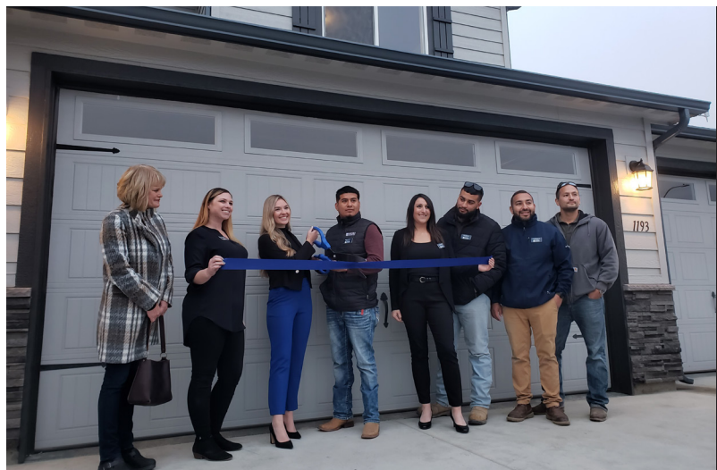
Hayden Homes Ribbon Cutting 11/09

We hosted 22 Ribbon Cuttings for grand openings, anniversaries, re-brandings and relocations in 2023. We look forward to helping even more Walla Walla Valley businesses celebrate with the big scissors in 2024!