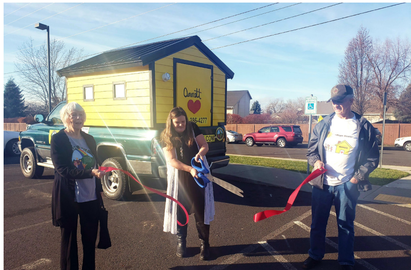
Hope Heals Ribbon Cutting 12/13